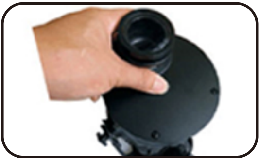
6.Put case back & tighten screws