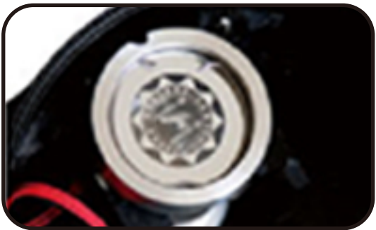
5.Change glass & put ring back